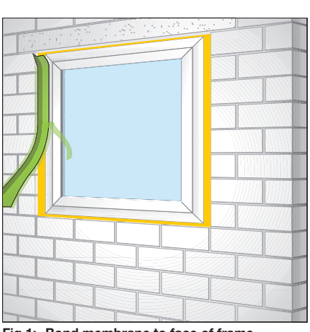
Fig 1: Bond membrane to face of frame

• The membrane should be bonded to the external face of the frame, applying in individual strips to each side and allowing an extra 50mm in length to allow for lap jointing at the corners (fig 1). Alternatively, it is possible to fix continuously around the frame by carefully folding the membrane at the frame corners and finally making a lap joint to close the beginning and end sections.